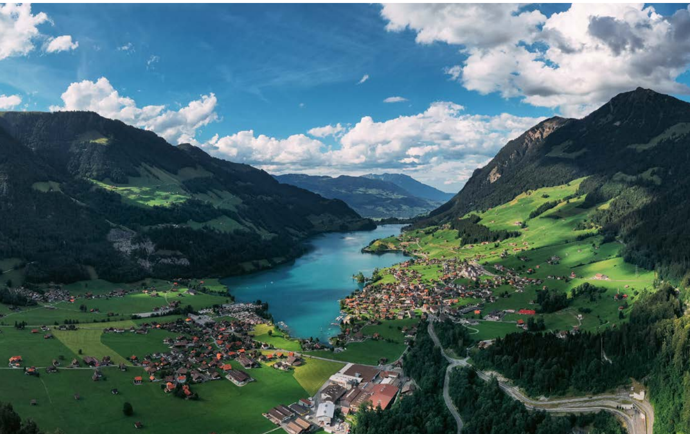
View from the Brüning Pass over Lungern to Kaiserstuhl

contact@topakustik.ch www.topakustik.ch T +41 41 679 73 73